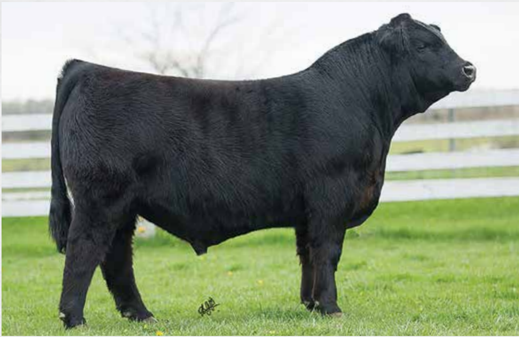
FWLY LHC CAPITAL Sire of Lot 17