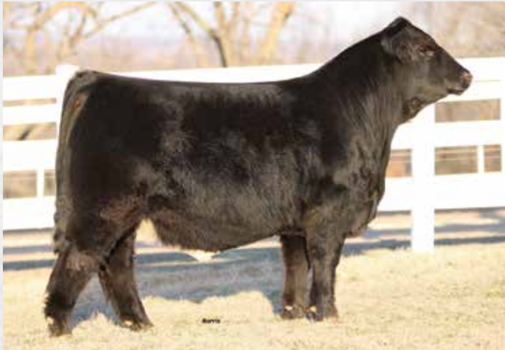
SSTO KASH MONEY 204K ET | Sire of Lot 21