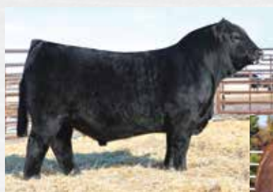
WULFS JOINT VENTURE G579J