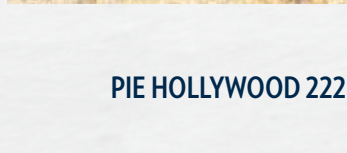
PIE HOLLYWOOD 222