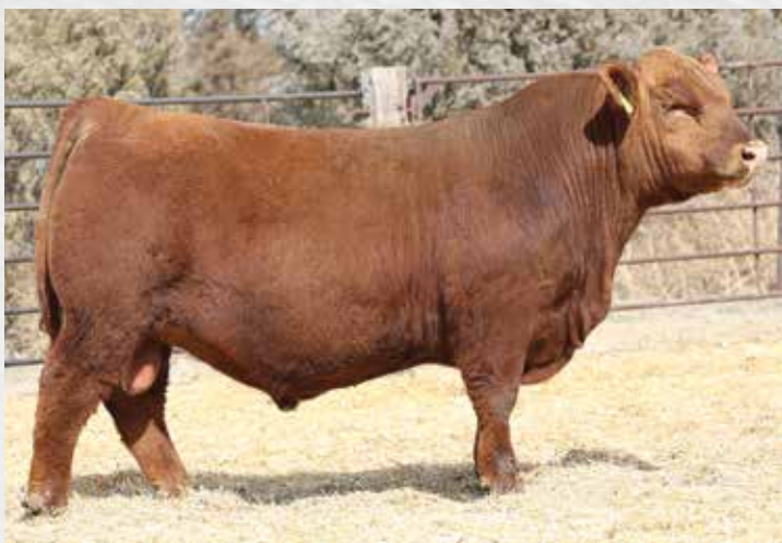
PIE HASHTAG 1249 | Sire of Lot 42