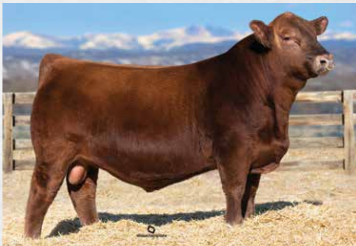
J6 MAXED OUT 121G | Sire of Lot 53