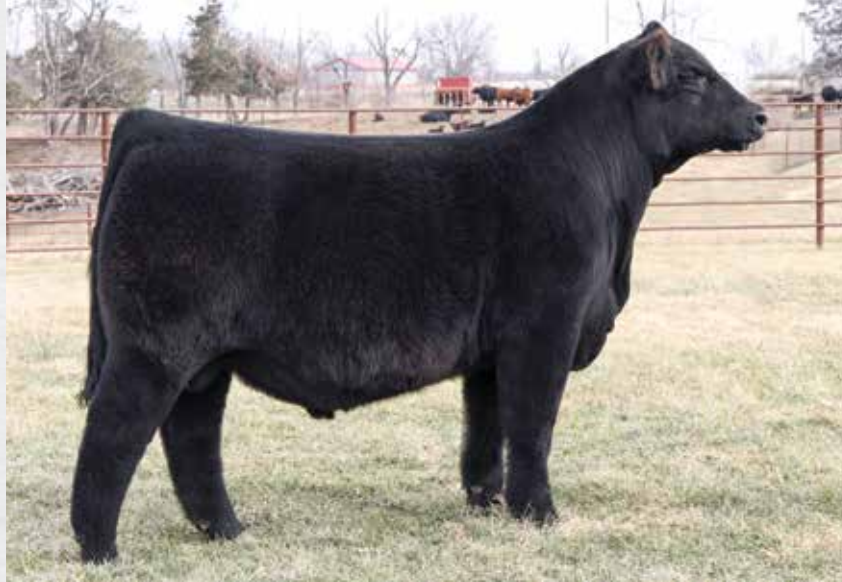
CELL KEYSTONE 2221K ET | Sire of Lot 4