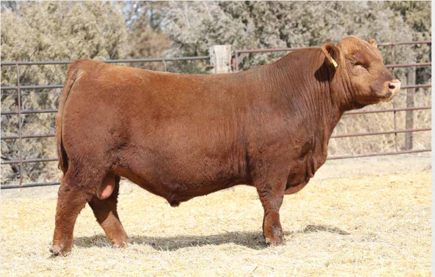
PIE HASHTAG 1249 | Sire of Lots 40 & 41