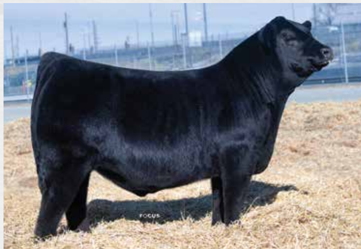
OLIM KEYSTONE 23K | Sire of Lot 28