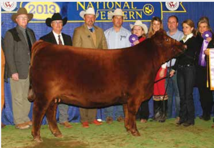
SIX MILE LAKOTA 112Y | Maternal grandam of Lot 39