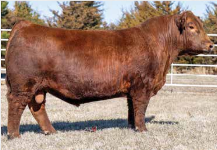
PIE HOLLYWOOD 222 | Sire of Lot 38