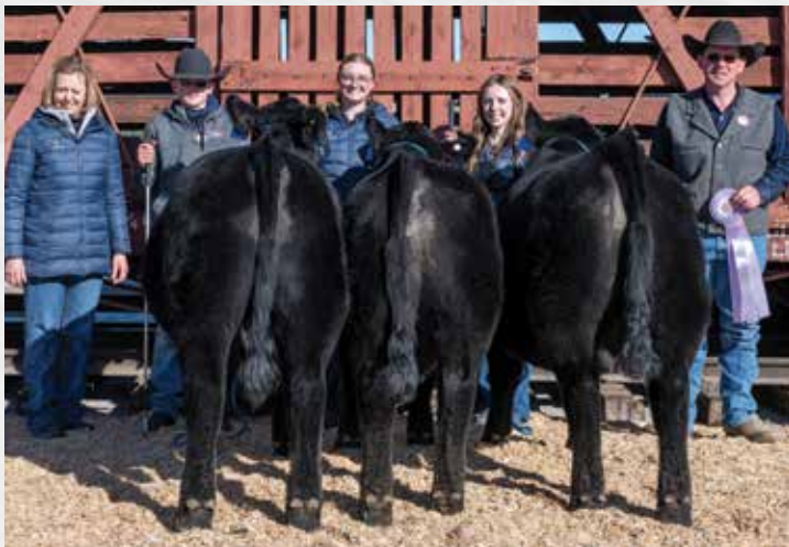
LOT 1-3 | National Western Stock Show