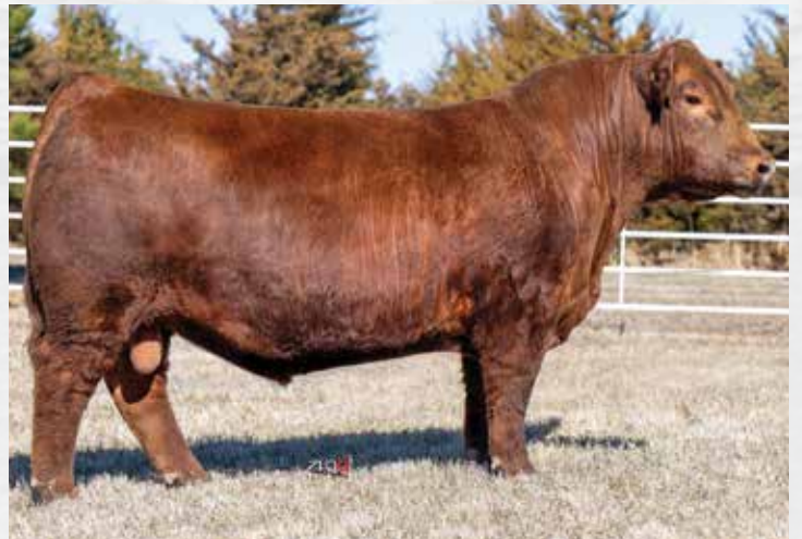
PIE HOLLYWOOD 222 | Sire of Lot 43

A powerhouse of a herd sire prospect that deserves your attention with single digit rankings for his growth EPDs. This PIE Hollywood 222 son has profitability written all over him and when you see him in person, you'll understand why. We've always loved his soggy build, the substance of bone he stands on and his commanding presence. His Weaning Weight, Yearling Weight and Carcass Weight EPDs are in the top 1% and his Ribeye Area is in the top 3% of the breed. With splendid growth EPDs like these, he can take your herd to the top in a flash.