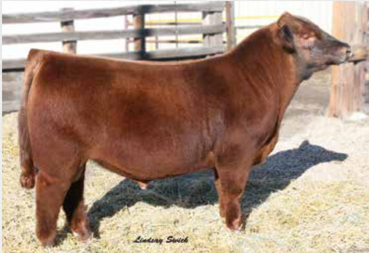
WEBR TC CARD SHARK 1015 | Maternal grandsire of Lot 58