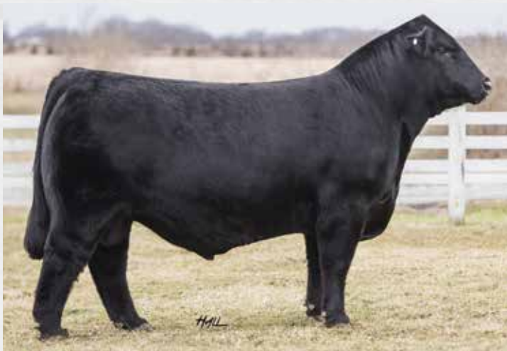
FWLY CAN DO | Sire of Lot 22