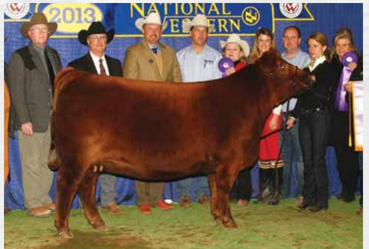
SIX MILE LAKOTA 112Y | Maternal grandam of Lot 35

Here is another PIE Hashtag 1249 son that hits you hard. He is level topped with extra center capacity and moves freely off both ends of his skeleton. Mark him high on your list if you are looking for a do-it-all herd sire that will add dollars to your program. Numerically, J6RA 219M carries a well-balanced number set worth studying. This bull's dam is Rojas Belly Dancer 5039, a female sired by the legendary, Leachman King Rob, the maternal grandsire of the famed CT Cita 4060 female. He is ready to hit the pasture and take control of breeding duties.