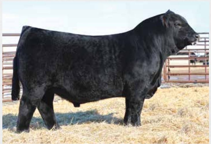
WULFS JOINT VENTURE G579J | Sire of Lot 12