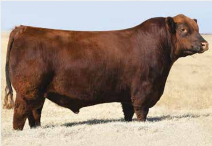
MANN RED BOX 55C | Sire of Lot 29