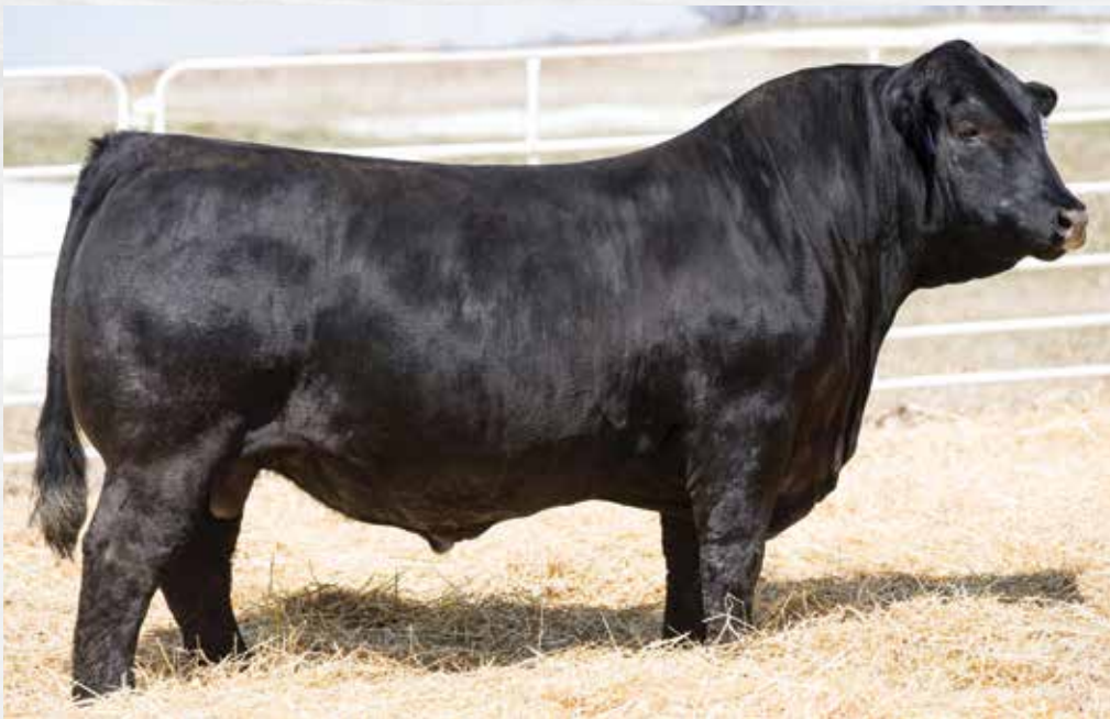
CJSL DATA BANK 6124D Sire of Lot 18

BW: 72 | ADJ. WW: 628 | ADJ. YW: 1072 | AVG. DMI: 21.66 | ADG: 3.17 | RFI: 2.18 | FCR: 6.84