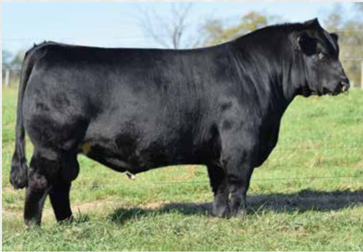
CJSL DAUNTLESS 6257D ET | Sire of Lot 11