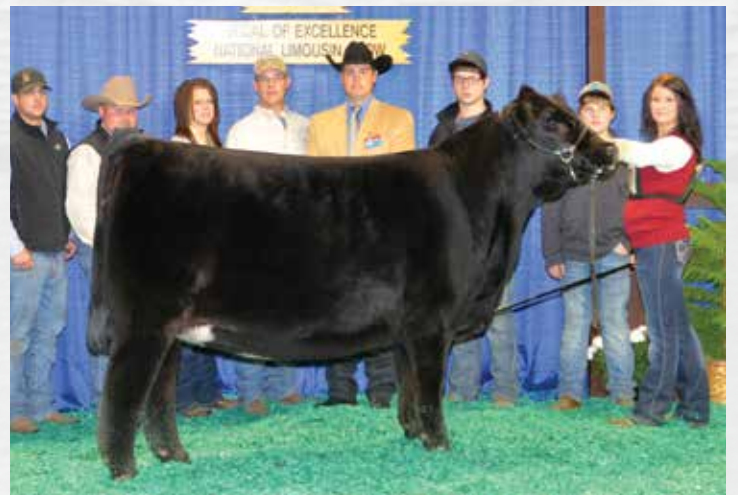
LLJB ABSOLUTE STYLE 3056A | Dam of Lot 23

Be sure to not overlook this wide-bodied, thick-ended, deep-centered individual. His sire is TASF Heineken 405H, the $44,500 top-selling lot from the 2021 Thomas & Son Farms Sale. His dam is none other than LLJB Absolute Style 3056A, the daughter of Silveiras Style 9303 and MAGS Wassail. LLJB Absolute Style 3056A was successfully campaigned by Shelby Hennessey and was named the 2014 NAILE Grand Champion Limousin Female. Add this homozygous polled sire to your bull pen to create highly marketable calves.