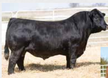
CJSL DATA BANK 6124D ET