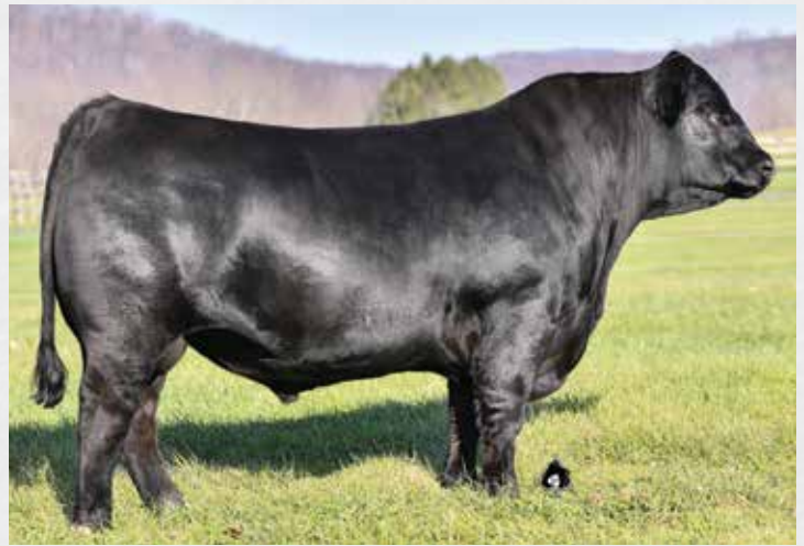
COLE GENESIS 86G | Sire of Lots 59 & 60