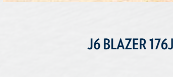
J6 BLAZER 176J