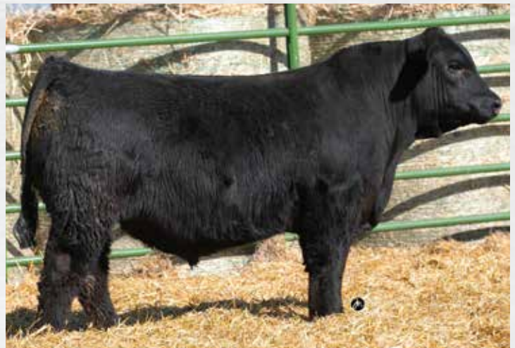
SCHILLING JOHN DEERE | Sire of Lot 61