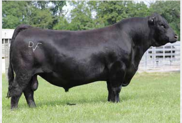
DEER VALLEY GROWTH FUND | Maternal grandsire of Lot 60