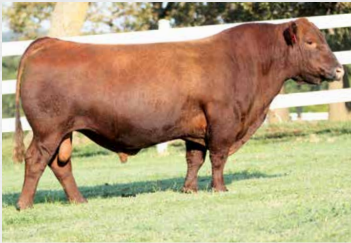
WEBR MAXED OUT 627 | Maternal grandsire of Lot 34