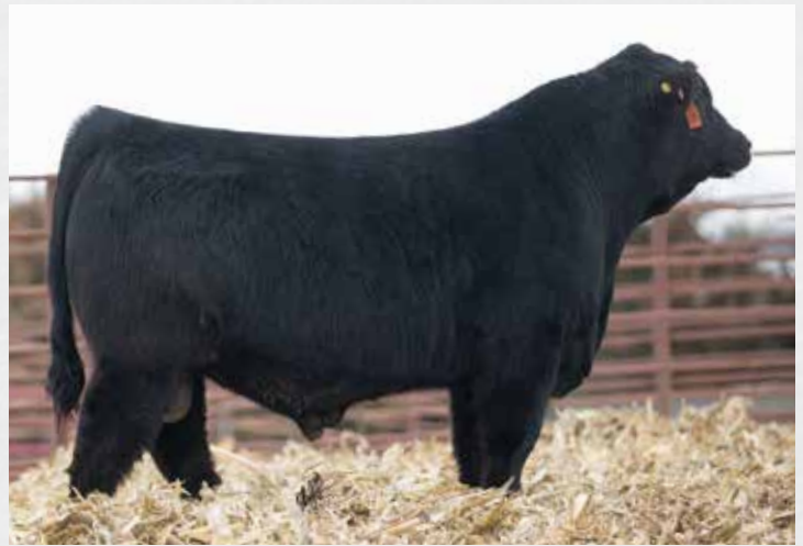
CELL HISTORY BUFF 0245H ET | Sire of Lot 8