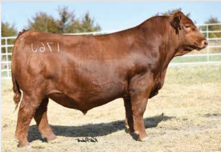
J6 BLAZER 176J | Sire of Lot 31