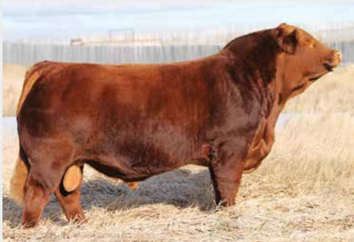
HUNT CREDENTIALS 37C ET | Paternal grandsire of Lot 52