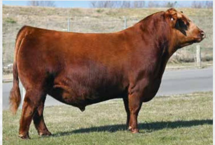
J6 BULLETPROOF 542K | Sire of Lot 56