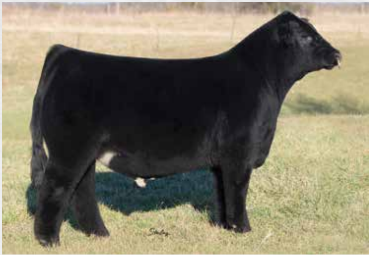
RATLIFF JUMP START 340J ET | Sire of Lot 16