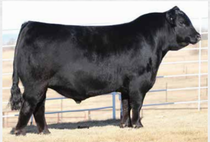
MAGS CABLE | Paternal grandsire of Lot 57