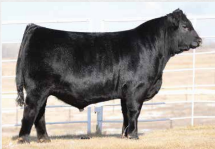
MAGS FEDERAL RESERVE ET | Sire of Lot 45